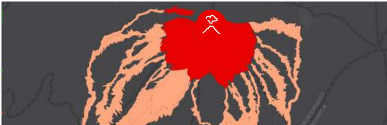
Data on Specific Volcanos (Layers > Regional Data)