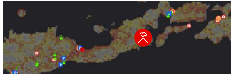
Population Density & Infrastructure