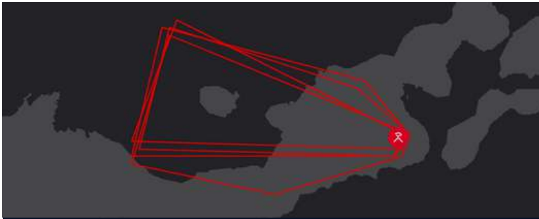
Ash Clouds - Observed & Forecast (Hazard Tooltip)

See Layers > Hazards and Events > Volcano for all associated hazard layers.