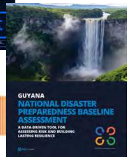
National Baseline Assessment